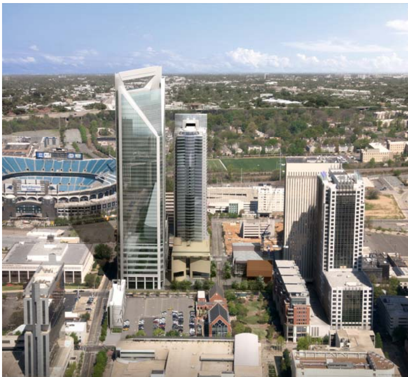
Rendering by Spine 3D

If you have any questions or need additional information, please feel free to contact Molly Fowler at molly.fowler@wachovia.com or call (704) 374-6760.