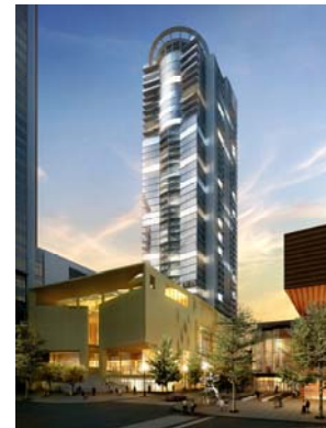
Rendering by Spine 3D

While construction of the Wachovia condominiums is not moving forward at this time, the infrastructure has been built, the table has been set, for a future high rise condominium/hotel to be located in the heart of the Wells Fargo Cultural Campus. It will rise above the Mint Museum, with residences beginning on the tenth floor, and will feature street level retail and restaurants. The Bechtler Modern Art Museum and the Knight Theater will be located immediately across First Street, and parking will be conveniently located in a secure private garage beneath the tower and hidden from the street.